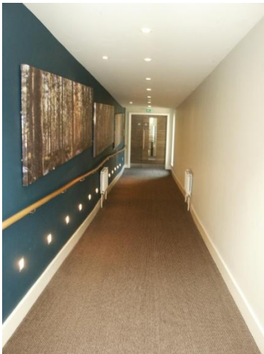
View of ramped access corridor to Disabled bedrooms

There are disabled friendly bedrooms available which are within the Woodland Rooms extension (not in the White House). The bedrooms are accessible by a lift and ramped corridor. The ramp on the link corridor has an incline of 1:20, with 2 x 7m inclines and a level rest area in the middle. The hotel porter will transport luggage from reception to bedroom for guests.