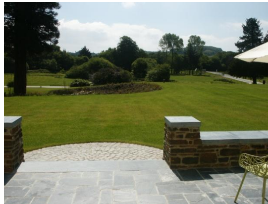
Steps from the Parkland Terrace to the lawn

There are disabled friendly bedrooms available which are within the Woodland Rooms extension (not in the White House). The bedrooms are accessible by a lift and ramped corridor. The ramp on the link corridor has an incline of 1:20, with 2 x 7m inclines and a level rest area in the middle. The hotel porter will transport luggage from reception to bedroom for guests.