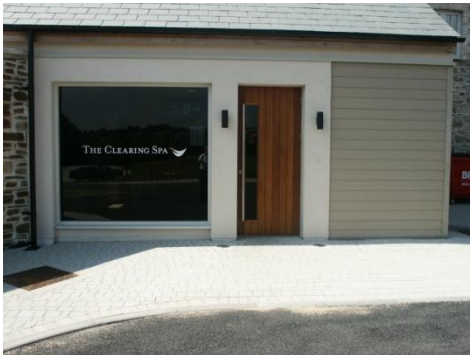
Entrance to the Clearing Spa from the car park

The Spa has designated disabled parking spaces situated in front of the Spa reception, with a level journey from the parking bays to the Spa reception.