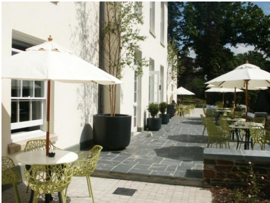
The Parkland Terrace