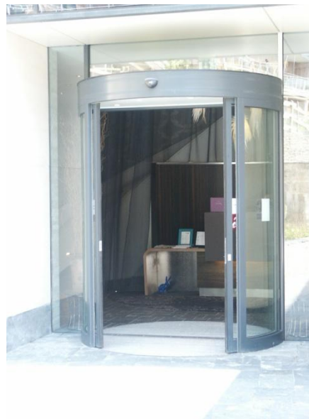
View of main hotel entrance doors to Reception

Reception is provided with a desk of two levels to help guests obtain a convenient worktop height. Guests may request writing materials to help convey their wishes.