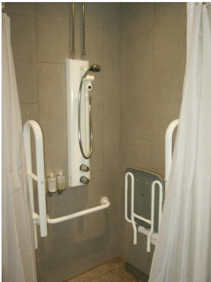
Two views of disabled changing / shower room for pool facilities

The pool has a designated disabled toilet / changing facility, which includes a wet room with shower.