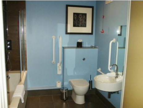
2 views of bathroom facilities within Disabled bedrooms