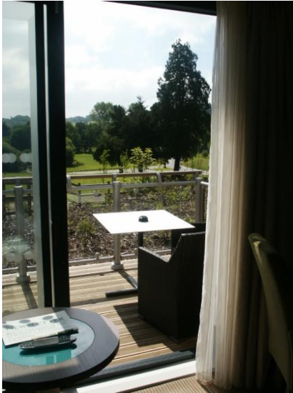
Patio door access to balcony – please note threshold

The king size beds fitted to these rooms have a floor to mattress height of 680mm. The mattress is zip linked, and can be split to produce two single beds if required. The Hotel can on request supply a lower bed with a floor to mattress height of 483mm; the bed will be made up in advance of your visit. Guests with hearing difficulties can request a vibrating pad to be placed under the pillows in order to receive a warning of fire alarm activation.