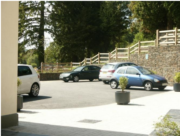
View from Reception to Disabled Parking

The hotel has designated disabled parking spaces situated in front of the hotel reception, and access from the parking bays to reception is a journey of approx. 50m, with a very slight gradient. This access route is either tarmac finish to the car park, or paved area in front of main reception doors. There are no steps or thresholds to negotiate into reception.