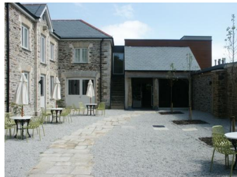
Courtyard terrace – please note surface finishes

The rear courtyard terrace has level access with a paved path through its length, however the surface to either side of this path consists of loose decorative stone chippings, and help may be required to transverse this area.